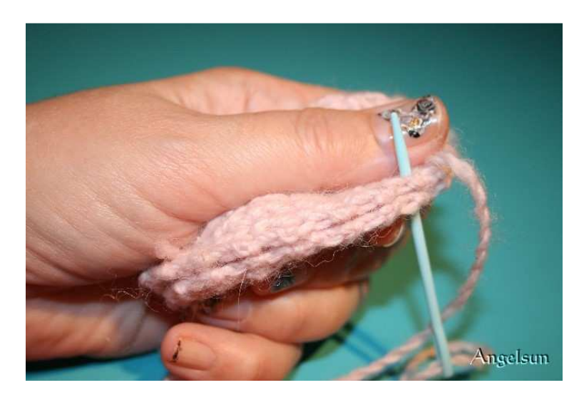
Turn to the right side and stuff. Stitch opening shut. Enjoy!!

Turn inside out and whipstitch the underside to the main body. Leave an inch opening.